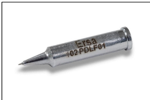
Figure 2: ERSADUR – Soldering tip, pencil point 0.1 mm

The main areas of application range from electronic development and production to reworking of fine SMDs on e.g. smartphones or electronic controls. The thin soldering tip and the very good temperature behavior are ideal for soldering PCBs under a microscope.